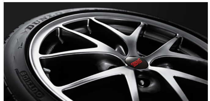
18-inch BBS forged aluminum alloy with high-lustre finish with STI centre caps (WRX STI Sport-tech Package)

Product details based on the latest information available at the time of publication and are subject to change without notice or incurring obligation. © 2014 Subaru Canada, Inc.