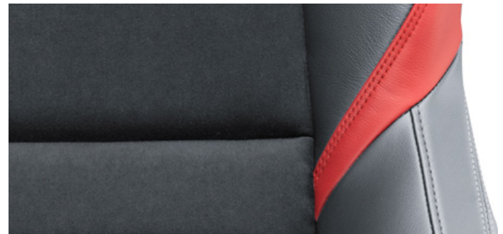
Anthracite Black Alcantara®/Red Leather (with red stitching)