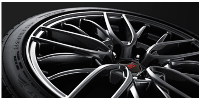
18-inch cast aluminum alloy with STI centre caps (WRX STI, WRX STI Sport Package)