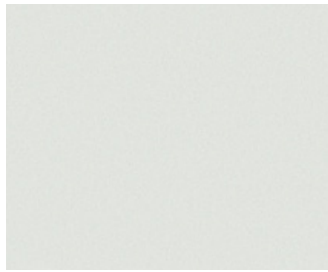
Crystal White Pearl