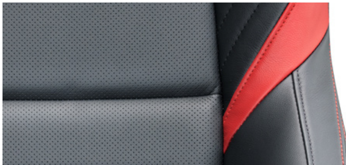
Anthracite Black Leather/Red Leather (with red stitching)