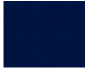
Galaxy Blue Silica