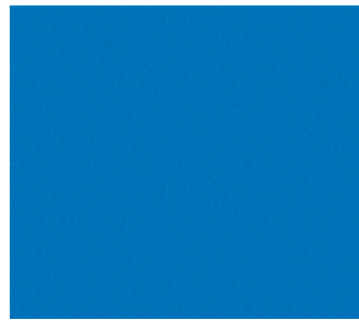
World Rally Blue Pearl