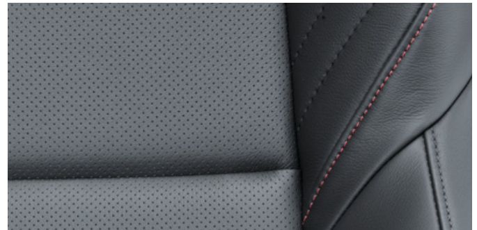
Black Leather (with red stitching)