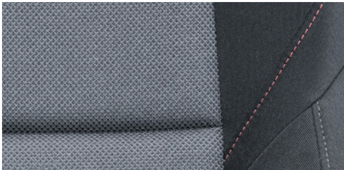
Anthracite Black Cloth (with red stitching)