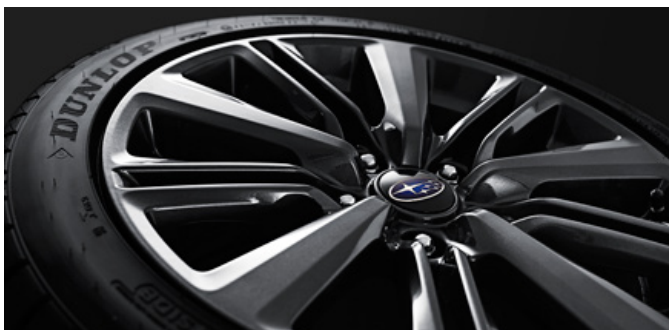
17-inch aluminum alloy with gunmetal coating