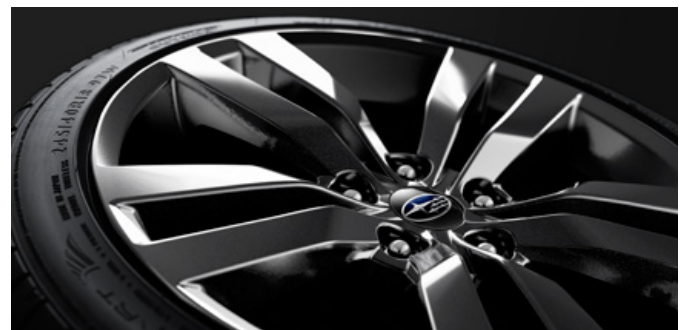
18-inch aluminum alloy with dark gunmetal coating

Product details based on the latest information available at the time of publication and are subject to change without notice or incurring obligation. © 2015 Subaru Canada, Inc.