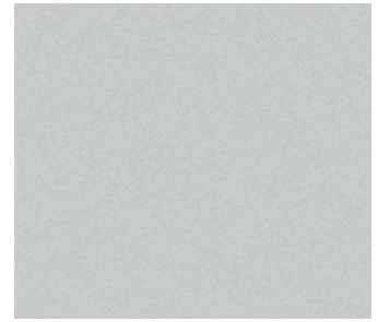
Ice Silver Metallic