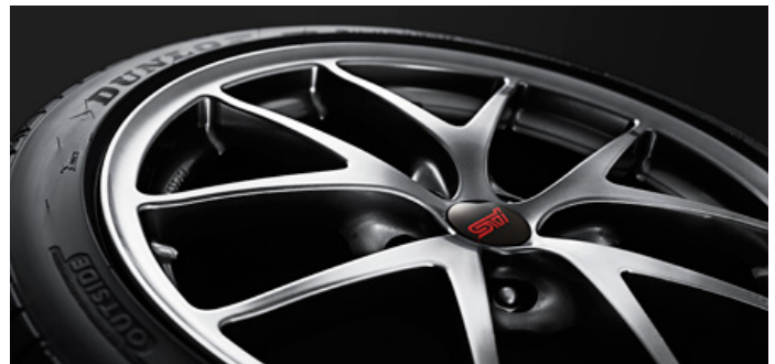
18-inch BBS forged aluminum alloy with high-lustre finish with STI centre caps (WRX STI Sport-tech Package)

Product details based on the latest information available at the time of publication and are subject to change without notice or incurring obligation. © 2015 Subaru Canada, Inc.