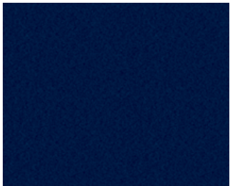
Lapis Blue Pearl